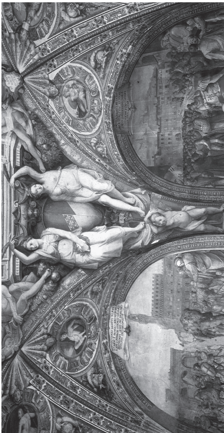
Fig. 1. Bernardo Poccetti, frescoes in the Sala grande of the Palazzo Capponi, Florence.